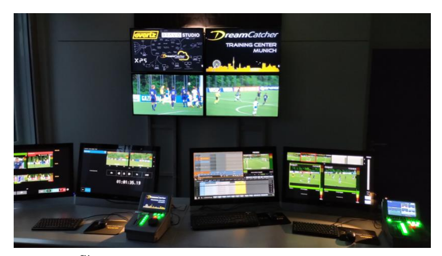
\label{lem:decomposition} \textit{DreamCatcher}^{\text{TM}} \ \textit{Training Center Munich is a new resource for professional broadcast operators to expand their knowledge of the award-winning \textit{DreamCatcher}^{\text{TM}} \ \textit{live production platform.}

Located in Munich's SpaceNet Building, DCTC has connectivity to perform full remote production workflow-based demonstrations of Evertz' XPS Real-Time UHD/3G/HD Streaming Platform and BRAVO Studio platforms.